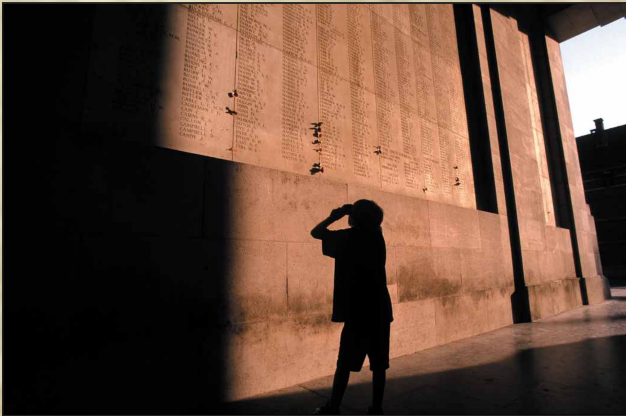
Menin Gate Memorial, Ypres, Belgium

“It is appropriate to observe ANZAC day as a day to honour the sacrifices made, and also peoples’ commitment to freedom... a launching pad for building a better world without wars.”